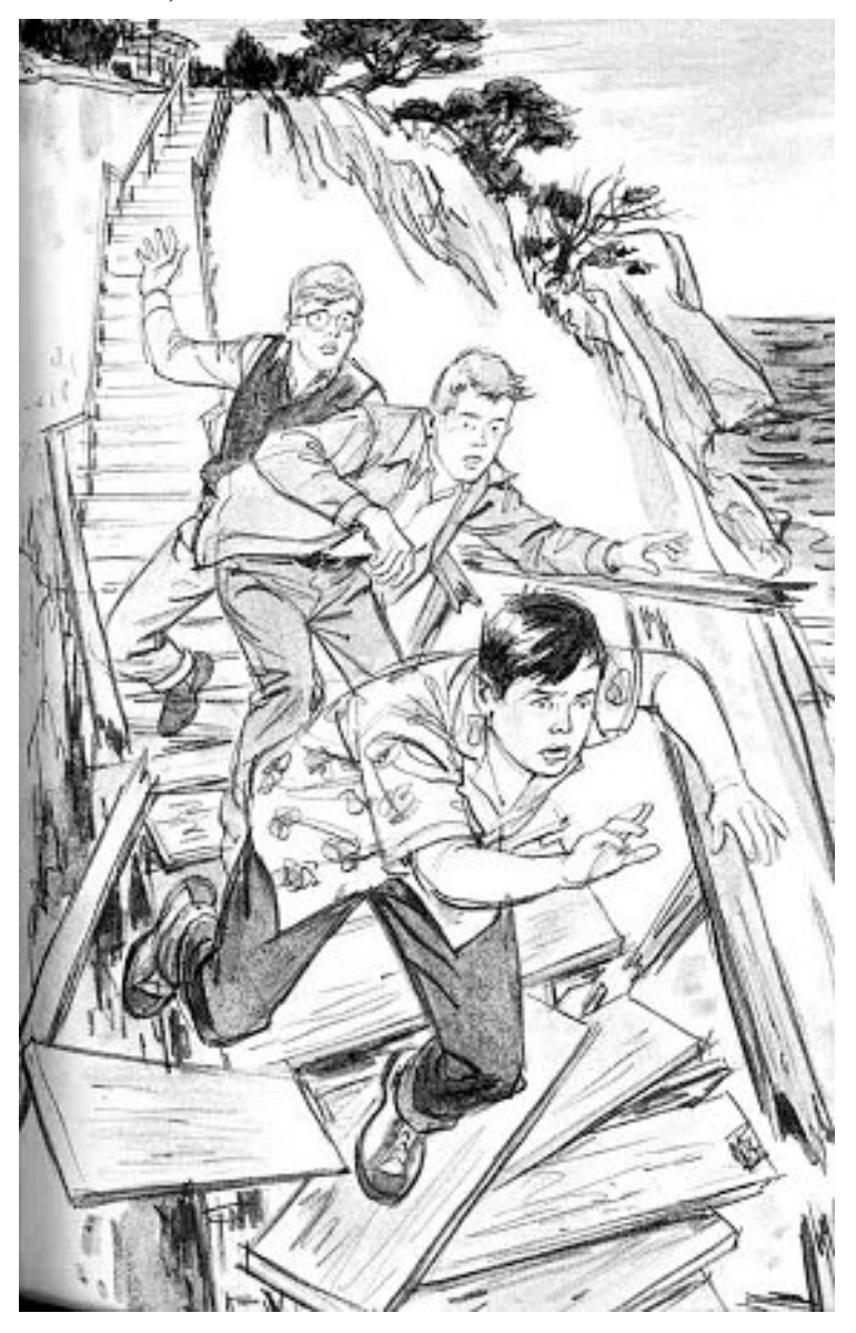
Helplessly, they plunged headlong downwards. Loose boards hurled after them.