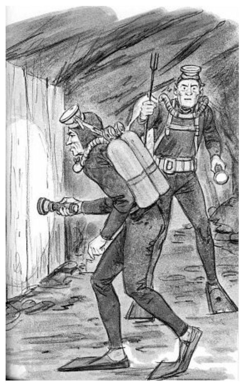
The men in the black wetsuits walked ahead. The light

Bob and Pete stooped over him, each with an eye at the crack.